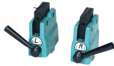
RB 1-200 with RP 1-W