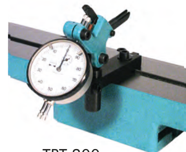
TRT 200 with dial gauges (optional)